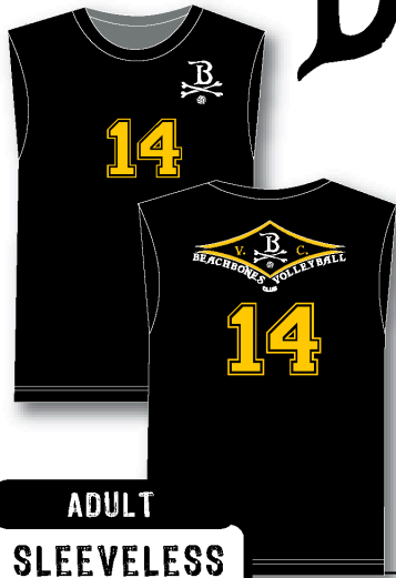
ADULT SLEEVELESS TEES

Essortex Sleeveless Tee# 32160 Color: Blk