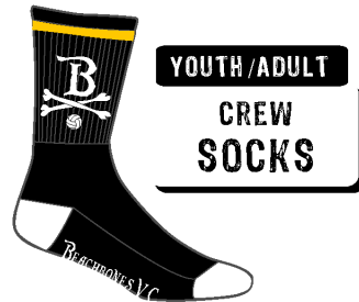
YOUTH / ADULT CREW SOCKS