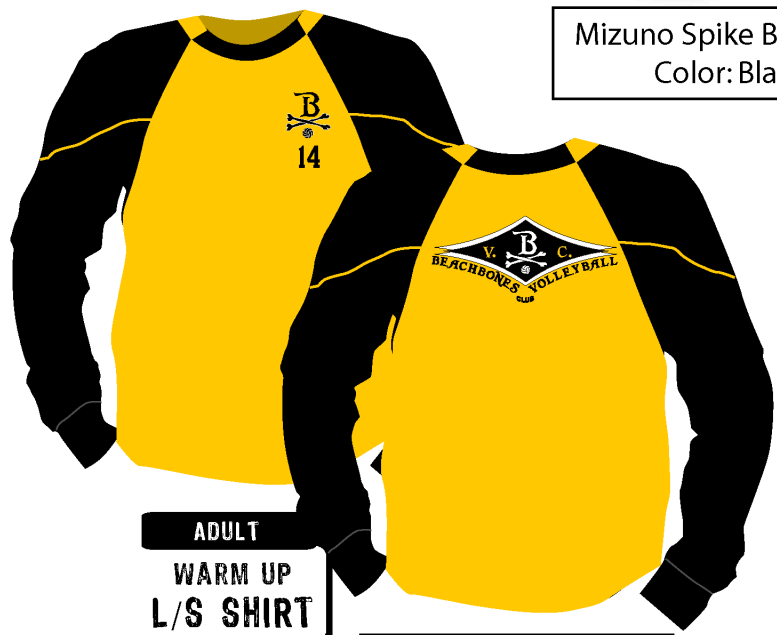
ADULT WARM UP L/S SHIRT