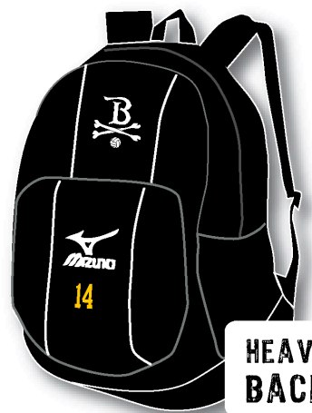
HEAVY DUTY BACKPACK