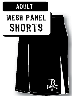
ADULT MESH PANEL SHORTS

Mercury Jersey# 42040 Color: Blk/white & Gold/white