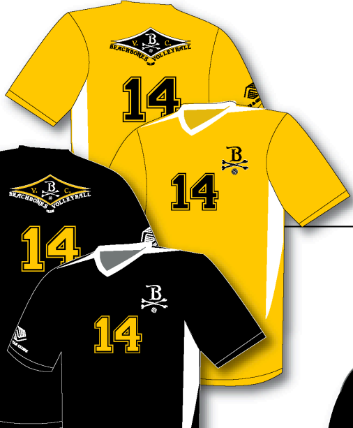
ADULT COMPETITION JERSEYS

Essortex Sleeveless Tee# 32160 Color: Blk